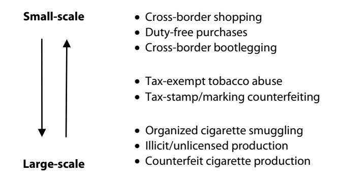
Figure 1: Types of Contraband Tobacco

Our study has been designed primarily to assess issues surrounding large-scale smuggling, given that most estimates suggest these activities result in the greatest losses of revenue. However, policies relevant to casual tobacco tax evasion, through purchases of tax-exempt tobacco from Aboriginal communities and other untaxed sources are also discussed.